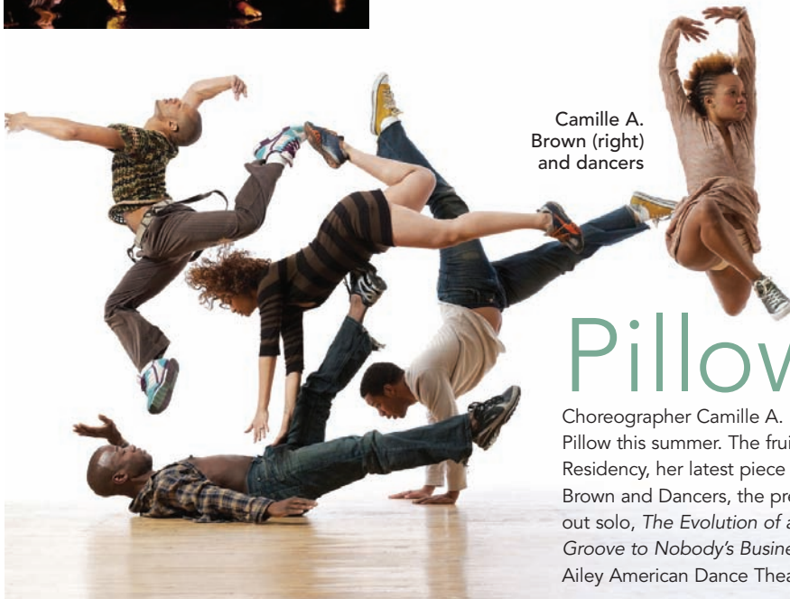
Camille A. Brown (right) and dancers