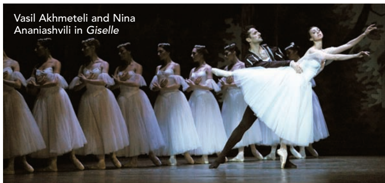
Vasil Akhmeteli and Nina Ananiashvili in Giselle